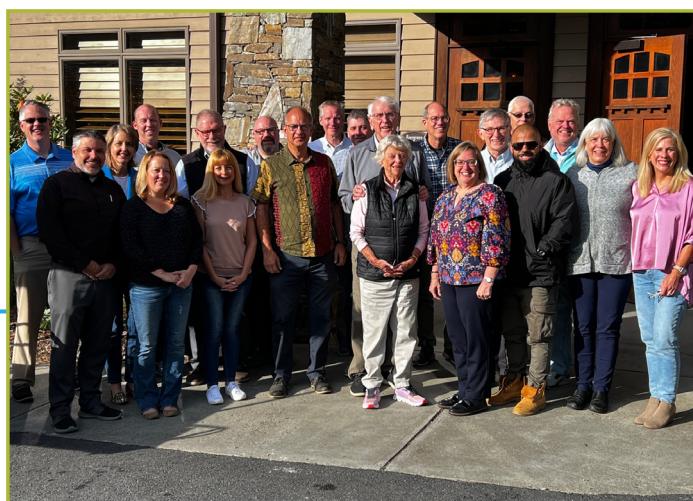
Our LFM Team gathered with a group of North American pastors in Blowing Rock, NC, this October for a mentoring experience.

Dad spent more than thirty years with Uncle Billy as an Associate Evangelist. Then, Dad stepped away from large scale evangelistic events — with Uncle Billy's blessing — to launch new ministries to identify, develop,